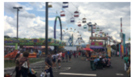
MOUNTAIN STATE FAIR 2018